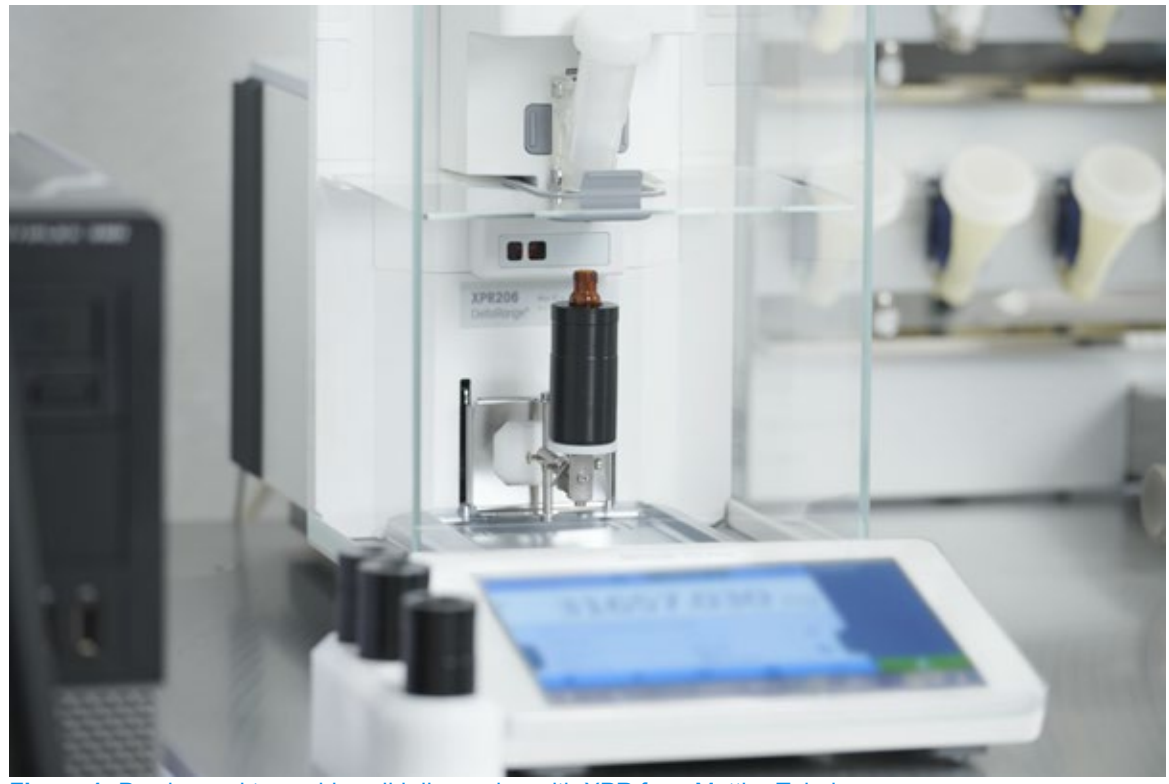
Figure 1: Precise and traceable solid dispensing with XPR from Mettler-Toledo.