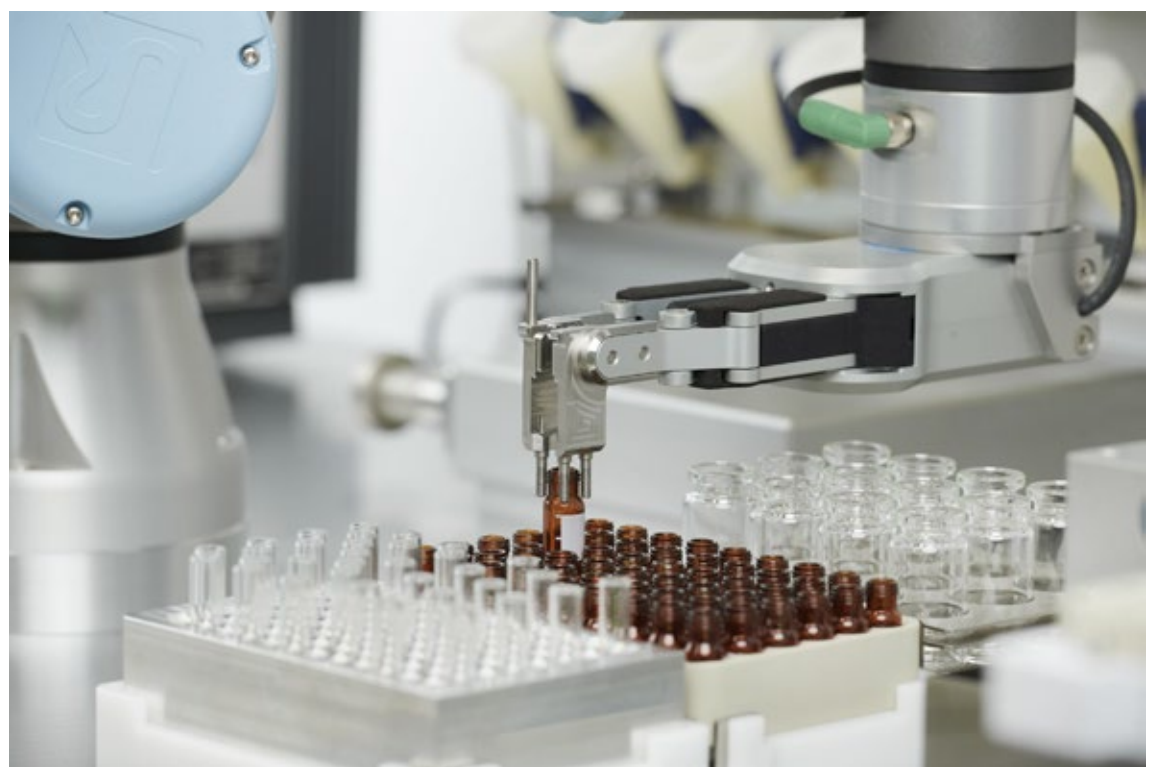
Figure 2: Various vessel sizes usable.